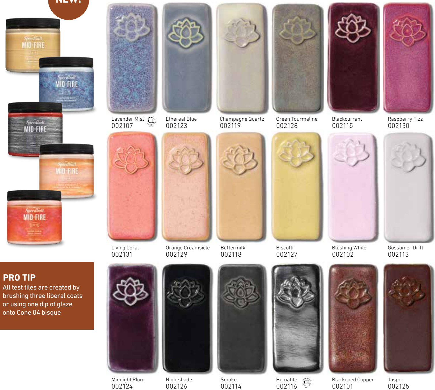
Lavender Mist 002107 Ethereal Blue 002123 Champagne Quartz 002119 Green Tourmaline 002128 Blackcurrant 002115 Raspberry Fizz 002130 Living Coral 002131 Orange Creamsicle 002129 Buttermilk 002118 Biscotti 002127 Blushing White 002102 Gossamer Drift 002113 Midnight Plum 002124 Nightshade 002126 Smoke 002114 Hematite 002116 Blackened Copper 002101 Jasper 002125