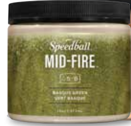
BY MEGAN SHAWKEY created with Mid-Fire Glazes (Blackened Copper + Basque Green)