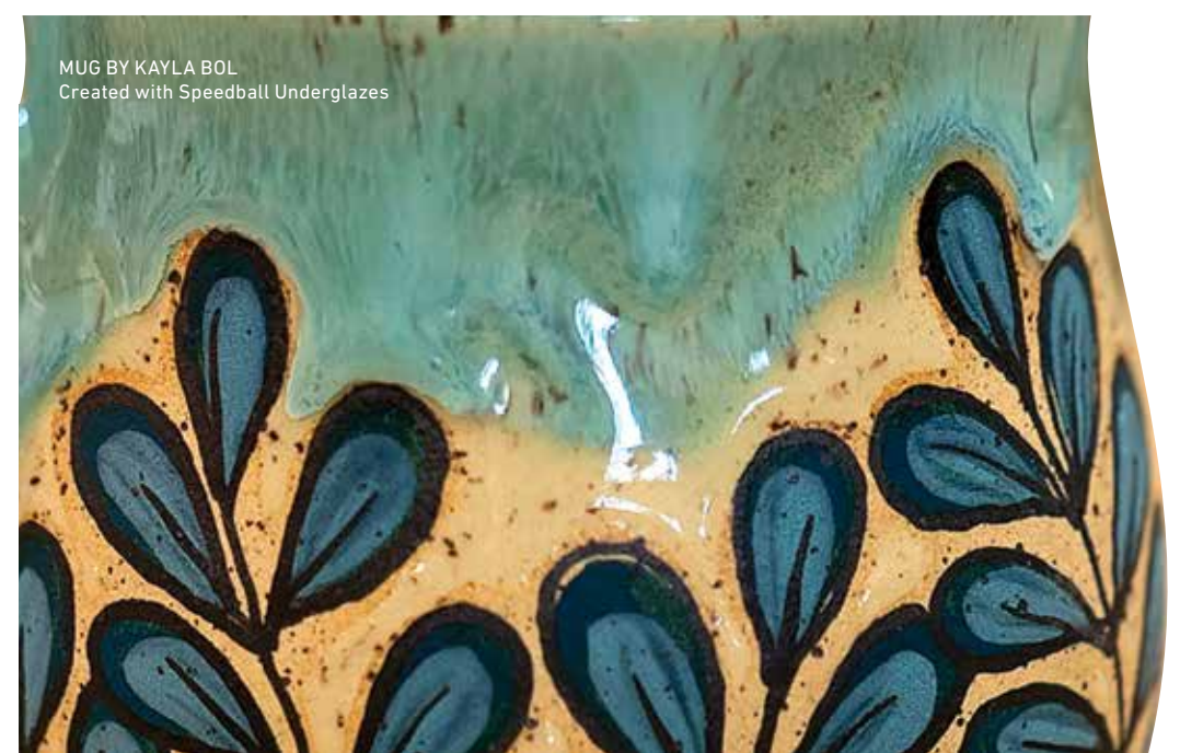
MUG BY KAYLA BOL Created with Speedball Underglazes