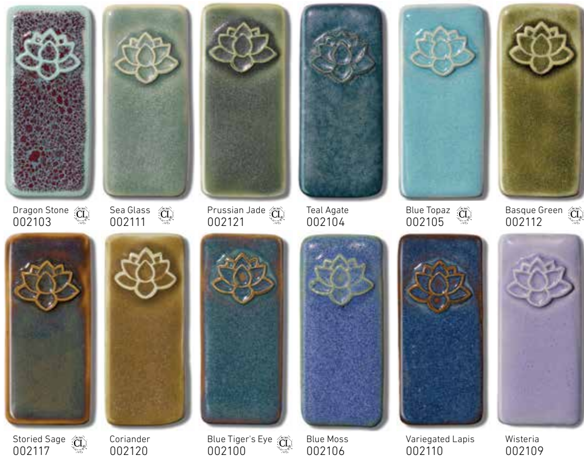
Dragon Stone 002103 Sea Glass 002111 Prussian Jade 002121 Teal Agate 002104 Blue Topaz 002105 Basque Green 002112 Storyed Sage 002117 Coriander 002120 Blue Tiger's Eye 002100 Blue Moss 002106 Variegated Lapis 002110 Wisteria 002109