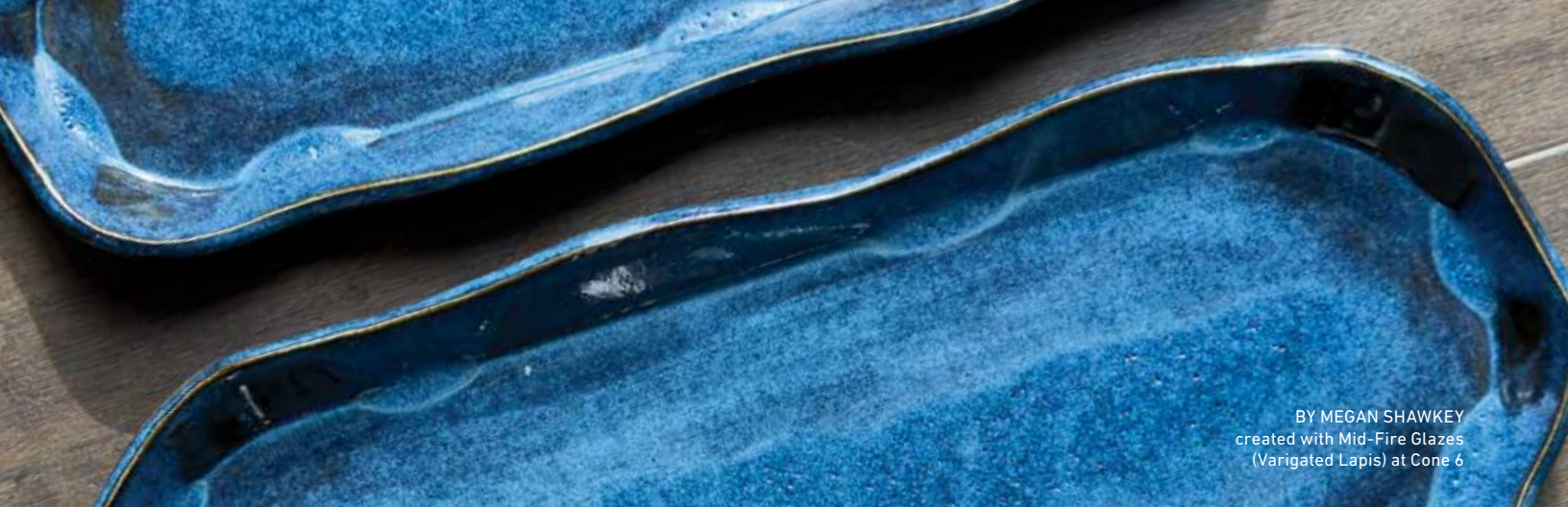
BY MEGAN SHAWKEY created with Mid-Fire Glazes (Varigated Lapis) at Cone 6