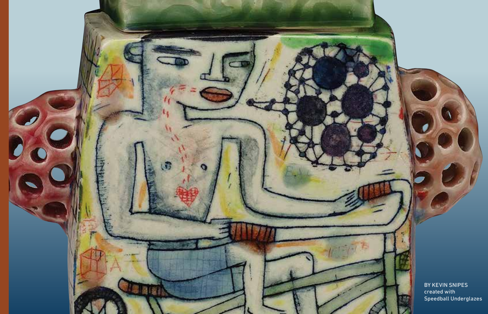
BY KEVIN SNIPES created with Speedball Underglazes