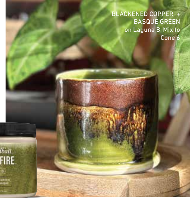
BLACKENED COPPER + BASQUE GREEN on Laguna B-Mix to Cone 6

Available in (30) colors in 16oz (473ml) jars. Lead-free and dinnerware-safe when used and fired as recommended.